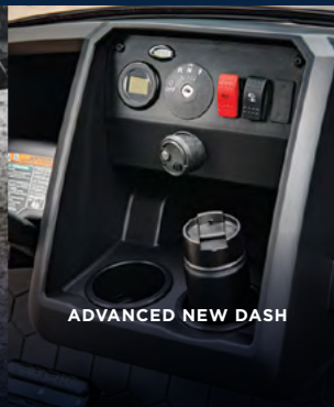
ADVANCED NEW DASH