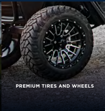
PREMIUM TIRES AND WHEELS