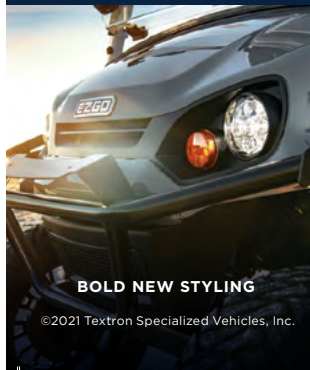
BOLD NEW STYLING

Extra flash. Extra swagger. Extra everything. The all-new Express Series from E-Z-GO® lets you add even more to your life. With bold styling and seating for up to six, it's just what you need to turn heads, anywhere you're headed.